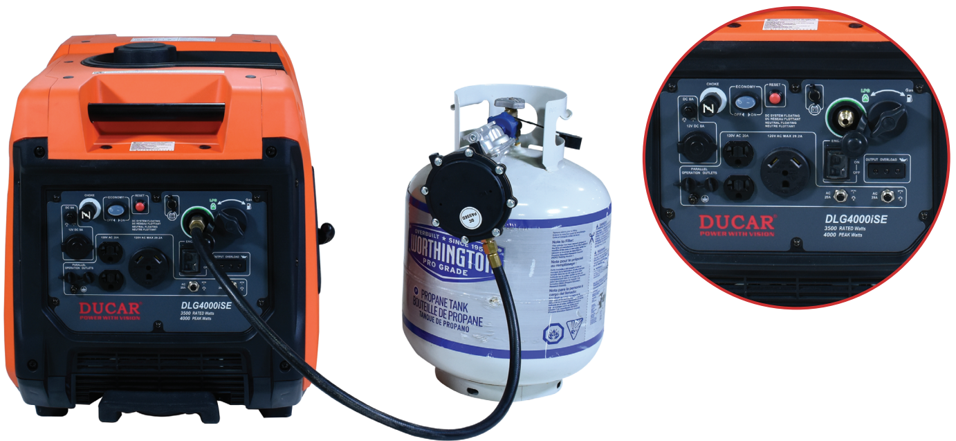
Diagramme de pièces Parts diagram

Le modèle peut différer légèrement de la photo / The model may differ slightly from the picture